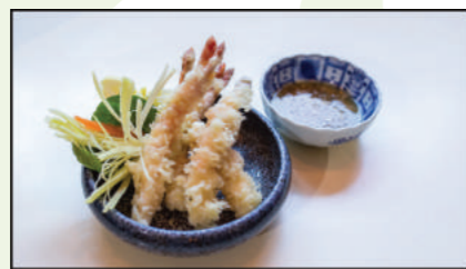
Above: Wakame Salad, Prawn Tempura