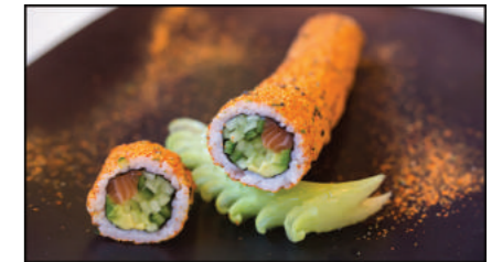
Above: Wakame Roll, Spicy Tuna Roll