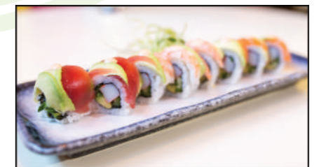
Above: Verde Veggie Roll, Rainbow Roll