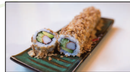
Above: Veggie Roll, Cali Crunch Roll